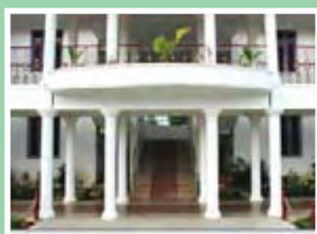
Hotel Sri Akshardham