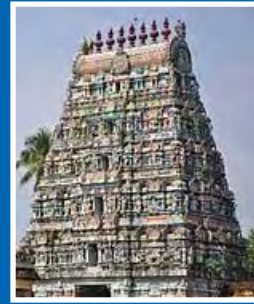
Chidambaram Nataraja Temple

Sirkazhi (11°13'48"N 79°43'48"E) is a city and a municipality in Nagapattinam district in Tamil Nadu, India. It is located just 10 km from the Bay of Bengal; 20 km from the famous Chidambaram temple town; 250 km from Chennai and 90 km from Pondicherry. A historic small town, Sirkazhi is surrounded by several legendary temples. Chidambaram Nataraja Temple, Thirukadiyur and Vaitheswaran Kovil Sattanathar Temple are the notable ones. The Shrine of 'Our Lady of Velankanni', also known as the "Lourdes of the East" is about 62 kms from Sirkazhi. The church can be traced to the mid-16th century and its founding is attributed to three miracles: the apparition of Mary and Jesus to a slumbering shepherd boy, the curing of a lame buttermilk vendor, and the survival of Portuguese sailors assaulted by a violent sea storm. The Nagore Dargah, a minaret built over the tomb of Hazrath Nagore Shahul Hamid (1490-1579 A.D.), a 13th generation descendant of the renowned sufi saint, Hajrath Muhiyudin Abd al-Qadir al-Jalani is located in the eastern coast of Bay of Bengal at Nagore, Tamil Nadu, about 48 km from Sirkazhi and is a common place of veneration of devotees of various religious faiths.