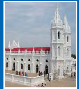
Our Lady of Velankanni Church